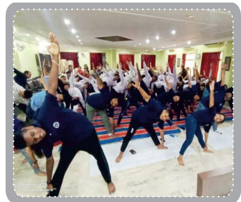
World Yoga Day