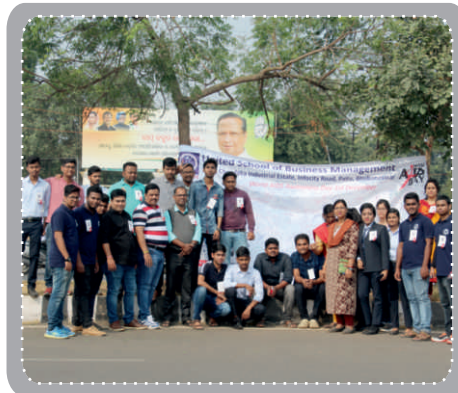
World AIDS Day