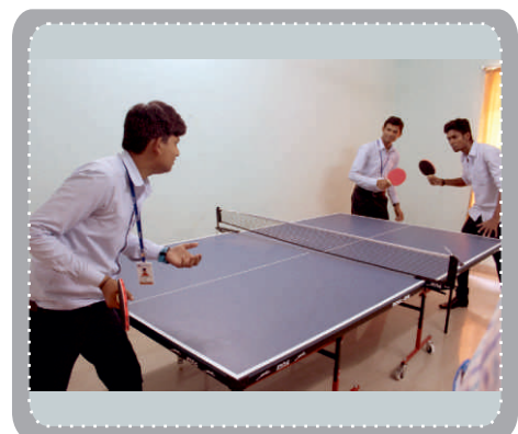
Students Enjoying Table Tennis