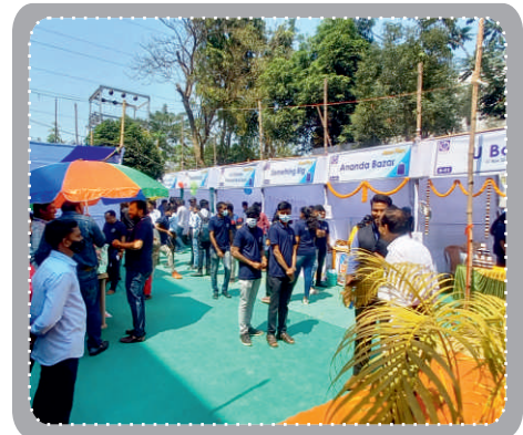
Apna Mart @ USBM